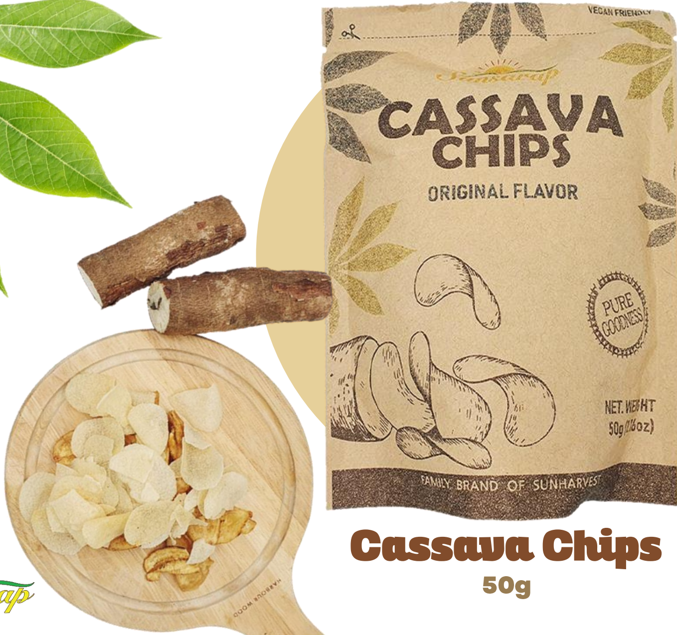
Cassava Chips 50g